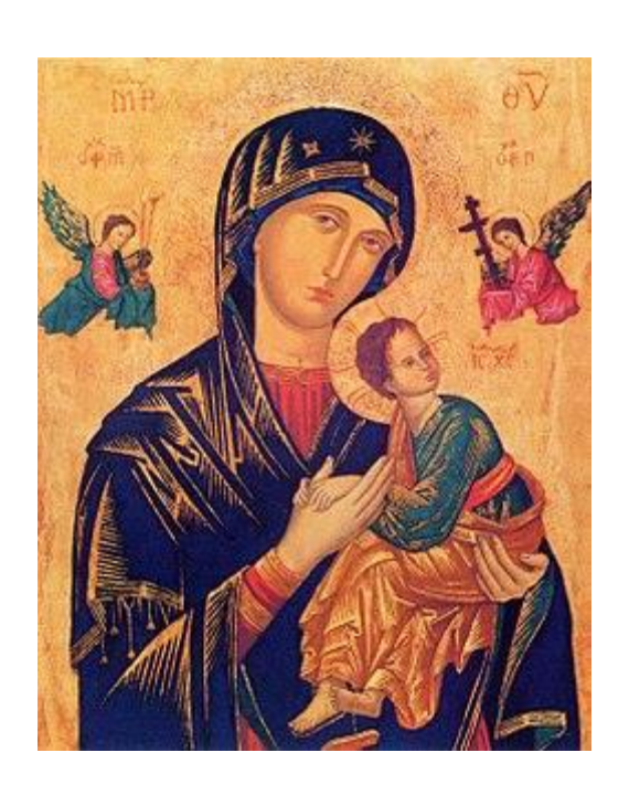
Our Lady of Perpetual Help – Pray for Us