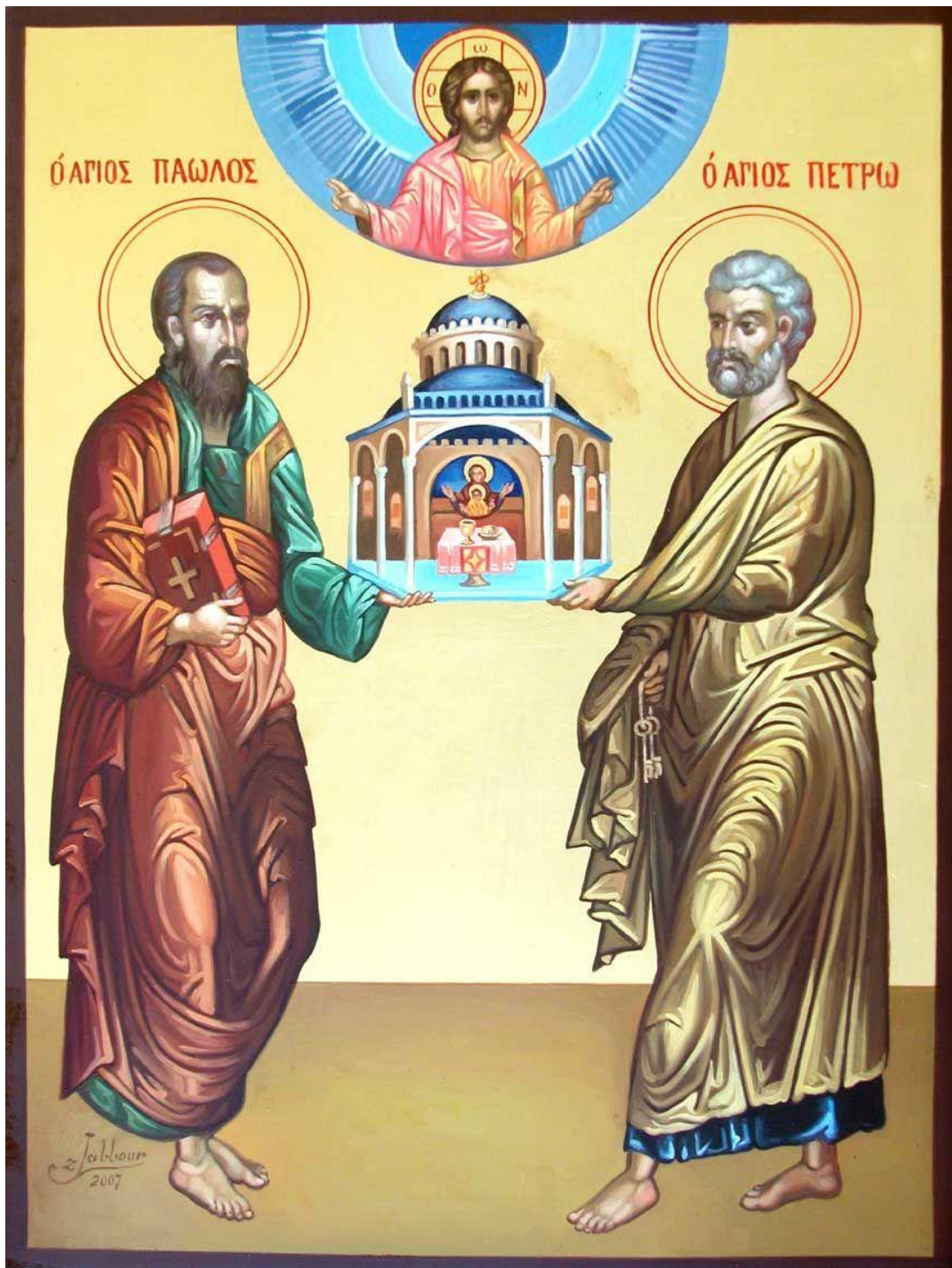
St. Peter and St. Paul, Pray for Us