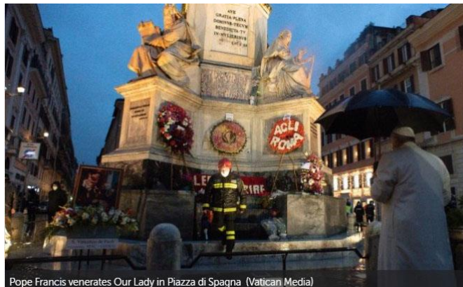
Pope Francis venerates Our Lady in Piazza di Spagna

And to exclude sin, he continued, it is also necessary to reject everything that is linked to it: "the worldly mentality, excessive esteem for comforts, for pleasure, for well-being, for wealth."