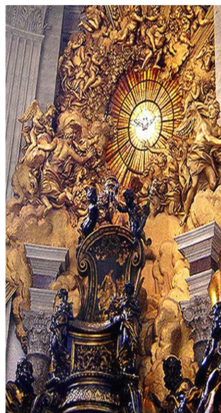
Chair of Saint Peter

St Teresa's School, Montacute Road, Morden.