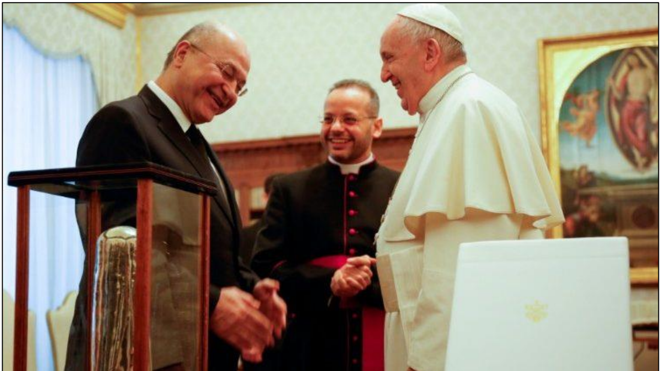
Pope Francis meets Iraqi President Barham Saleh on 25 January 2020

"Either we are brothers and sisters or we will destroy each other" said Pope Francis just a year ago. This week the Pope will visit Iraq where the stark logic of his warning is tragically visible.