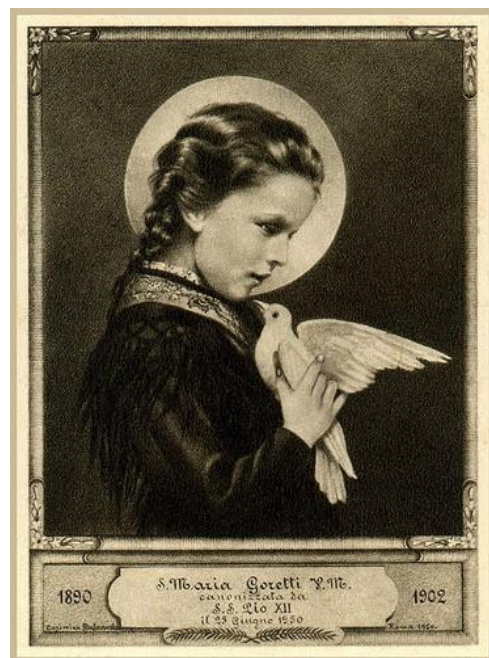
St. Maria Goretti

St Teresa's School, Montacute Road, Morden.