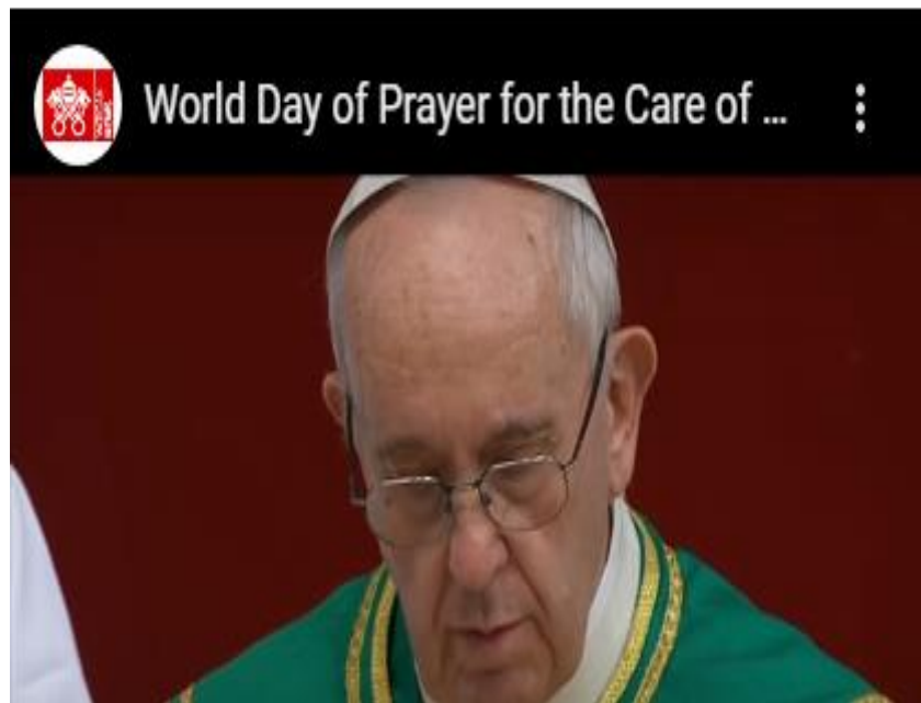
On the occasion of the first World Day of Prayer for the Care of Creation 1.9.2016, Pope Francis presides at the Liturgy of the Word