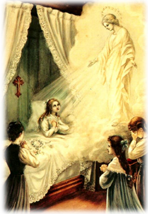
St. Thérèse of Lisieux Was Miraculously Cured by Our Lady of the Smile

O Mary, Mother of Jesus and our Mother too, who once by a visible smile did graciously console and cure your privileged child St Therese of the Child Jesus, we beseech you, come to us also to console us in the troubles of this life, detach our hearts from earth, give to us health of soul and body, make us strong in hope, and obtain for us at last, that we may enjoy for every in Heaven your maternal and enrapturing smile. Amen.