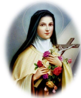
St Vincent of Saragossa