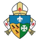
Archdiocese of Southwark