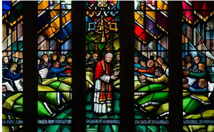
Stained-glass window in St George's Cathedral commemorating Pope John Paul's Visit to anoint the sick in 1982

Between 28 May – 2 June 1982, Pope John Paul II visited the UK: it was more than 400 years since a Pope had set foot on British soil! During this historic tour of the British Isles, he visited St George's Cathedral, Southwark, to anoint the sick, as well as the Polish Community at Crystal Palace and the Religious at Roehampton. There were sixteen sites visited in this short period of time, with many thousands of people blessed along the way.