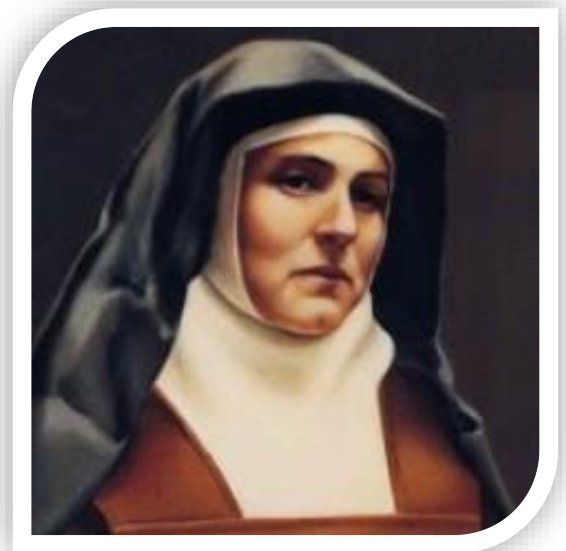
St Teresa Benedicta of the Cross (Edith Stein)