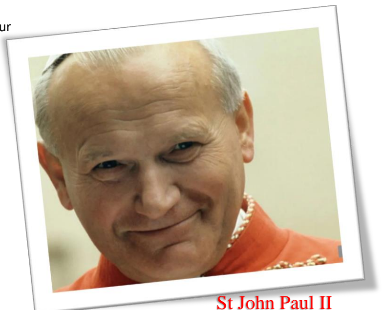
St John Paul II

St Teresa's School, Montacute Road, Morden. Tel No 020 8648 1846