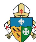
Archdiocese of Southwark

On behalf of the Archbishop, we invite you to attend the annual Diocesan Day for Catechists on Saturday 12 November 2022 at the Amigo Hall and St George's Cathedral, Southwark, SE1 6HR. This Day is for all the catechists of the diocese, including those involved in Liturgy of the Word for Children and the RCIA process, and is our first since 2019. Tea and coffee will be provided. Please bring a packed lunch. Please sign up on the list in the narthex by Sunday 6 th November or email the parish office at morden@rcaos.org.uk .