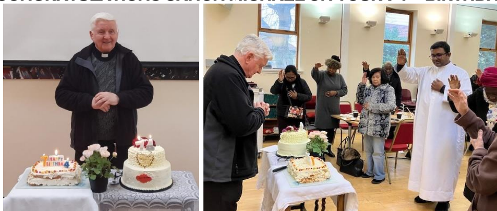
† BIRTHDAY CAKE AND A BIRTHDAY BLESSING †