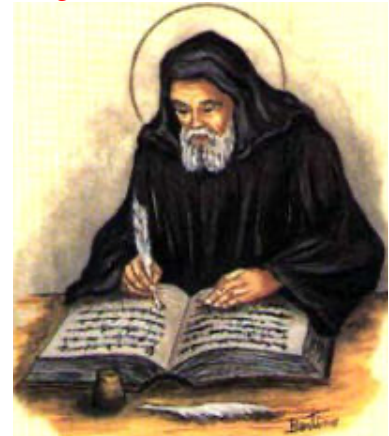
St Philip Neri