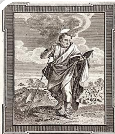
St. Matthew the Evangelist.