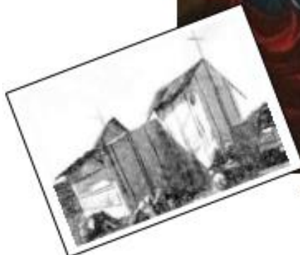
An icon at the Eritrean Church in the Calais Jungle